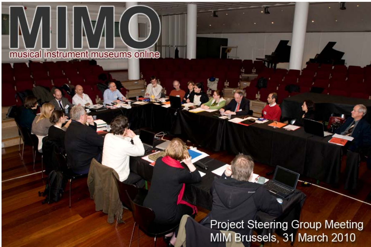
Project Steering Group Meeting MIM Brussels, 31 March 2010

The integrated press conference generated a huge response in the Belgian media. Please visit our website to read the articles.